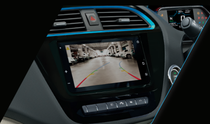
REAR-PARK ASSIST WITH CAMERA (WITH DYNAMIC GUIDEWAYS)