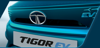
HUMANITY LINE adds a touch of beauty to the already electric Tigor