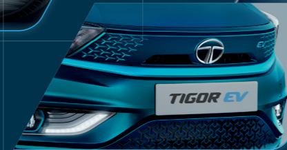
NEW FRONT GRILLE styled to create the perfect first impression