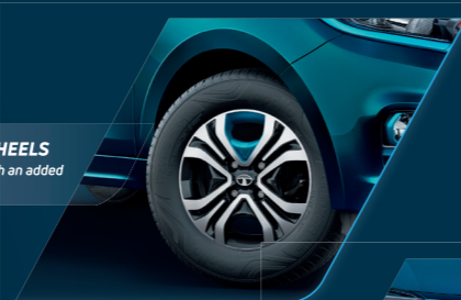
HYPER-STYLE WHEELS for the hyper cool you with an added touch of electric highlights