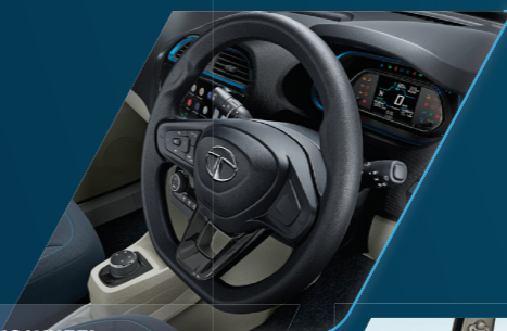
FLAT BOTTOM STEERING WHEEL for added comfort while you enjoy an electric drive