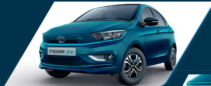
CONTEMPORARY STYLE to make you the trendsetter wherever you go