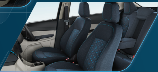
REAR SEAT designed with a foldable armrest and cup holders