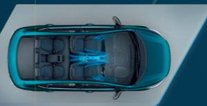
FULLY AUTOMATIC TEMPERATURE CONTROL for that chilled out drive experience (standard across variants)