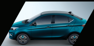
Signature Teal Blue

Colours Available: (XZ+ also available in Dual Tone option)