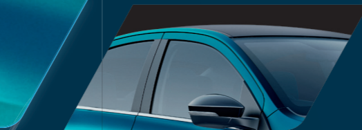
DUAL TONE exterior for an electrifying look