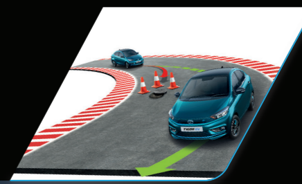
ABS WITH EBD AND CORNER STABILITY CONTROL