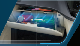
COOLED GLOVE BOX to keep things cool for that long drive