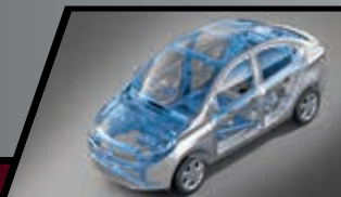
ENERGY ABSORBING STRUCTURE