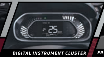
DIGITAL INSTRUMENT CLUSTER