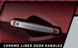
CHROME-LINED DOOR HANDLES