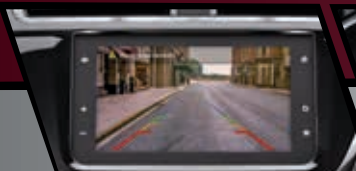
REAR PARKING ASSIST WITH CAMERA