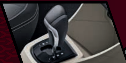
ADVANCE AMT TRANSMISSION