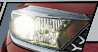
AUTOMATIC PROJECTOR HEADLAMPS