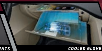
COOLED GLOVE BOX