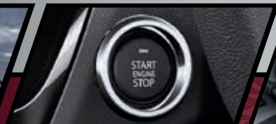
ENGINE START/STOP PUSH BUTTON