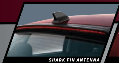
SHARK FIN ANTENNA