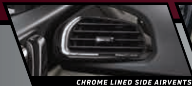
CHROME LINED SIDE AIRVENTS