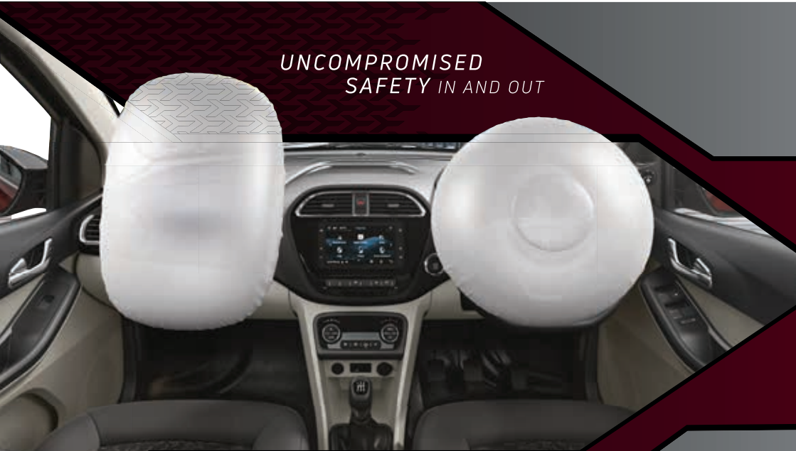
DUAL AIRBAGS AS STANDARD