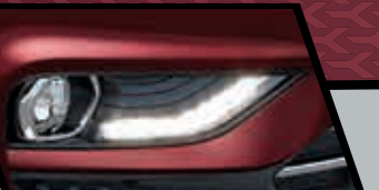
FRONT FOG LAMPS WITH CHROME RING SURROUNDS