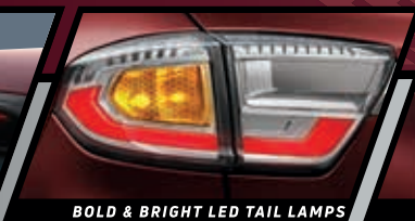
BOLD & BRIGHT LED TAIL LAMPS