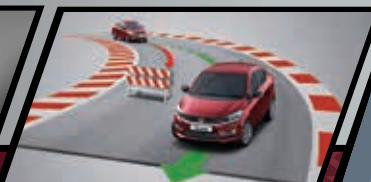
ABS WITH EBD AND CORNER STABILITY CONTROL