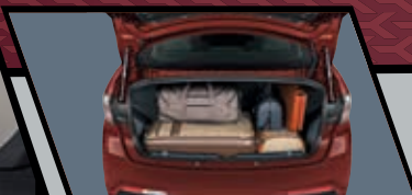
419L BOOT SPACE