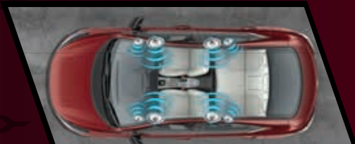
POWERFUL 8 SPEAKER SURROUND SYSTEM