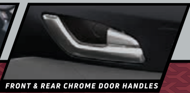
FRONT & REAR CHROME DOOR HANDLES