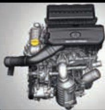
1.2L REVOTRON BS6 PH2 ENGINE