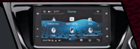
17.78 cm TOUCHSCREEN HARMAN™ INFOTAINMENT SYSTEM WITH ANDROID AUTO™ & APPLE CARPLAY™