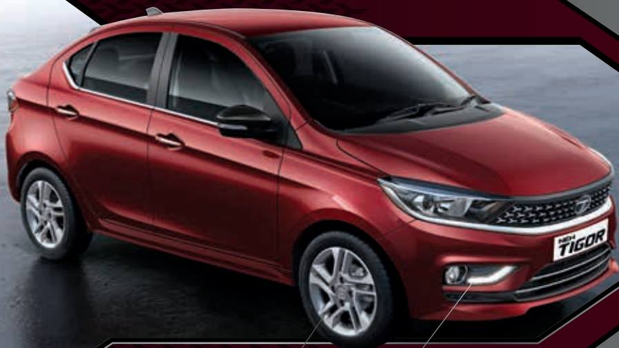
SONIC SILVER ALLOY WHEELS

STYLISH COUPE DESIGN. LUXURIOUS SEDAN STANCE.