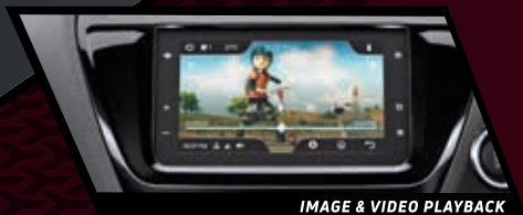
IMAGE & VIDEO PLAYBACK