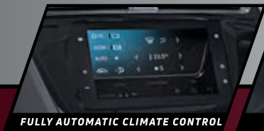
FULLY AUTOMATIC CLIMATE CONTROL