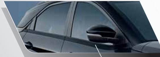
Satin Black beltline