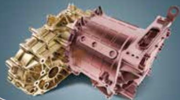
ELECTRIC MOTOR POWER Permanent magnet synchronous motor with peak output of 129 PS* and 245 Nm* torque