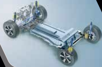
SUSPENSION Dual-path strut suspension