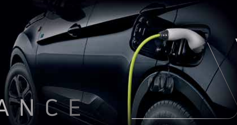
CHARGING CCS2-compatible charging with fast charging under 60 minutes* and regular charging from any 15 A plug point