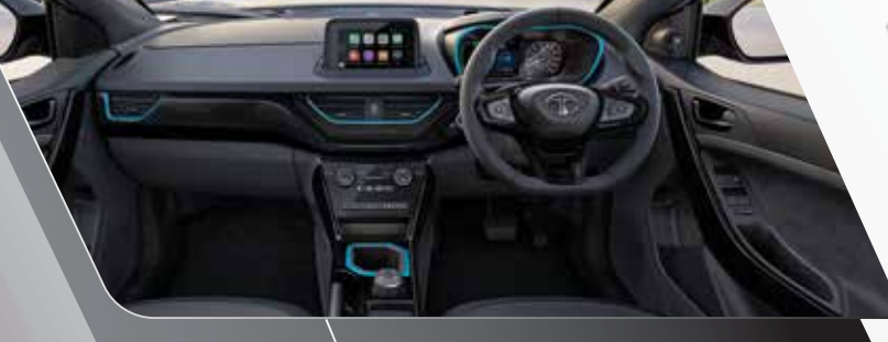
Premium dark-themed interiors Glossy Piano Black dashboard with signature tri-arrow pattern