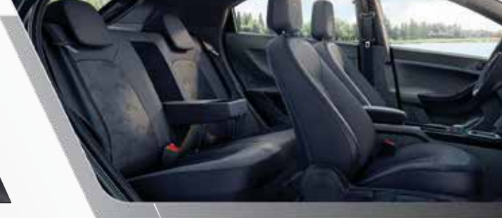
Luxurious dark-themed leatherette seats and door trims with tri-arrow perforations Standard rear armrest and 60:40 rear seat split