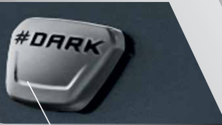
Exclusive #Dark mascot