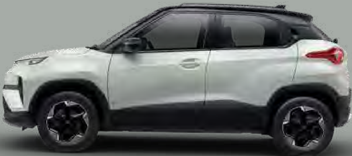
empowered oxide (dual tone)