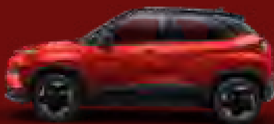
fearless red (dual tone)