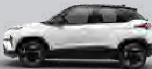
pristine white (dual tone)