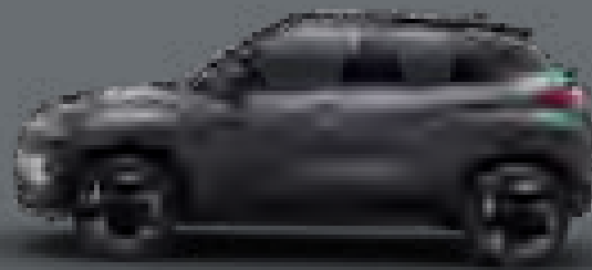
daytona grey (dual tone)