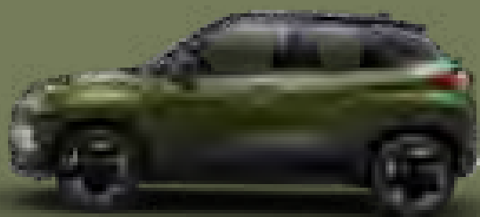
seaweed green (dual tone)