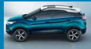
These three colours will be available in XZ+ and XZ+ Lux variants only.