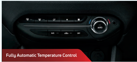
Fully Automatic Temperature Control