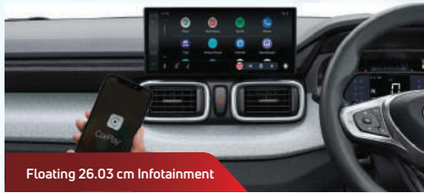
Floating 26.03 cm Infotainment