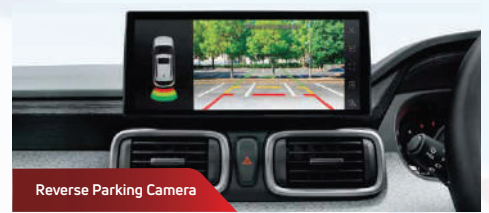
Reverse Parking Camera