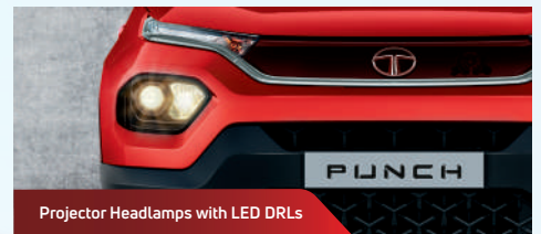
Projector Headlamps with LED DRLs